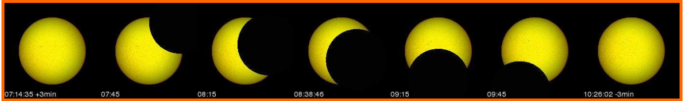
WHAT YOU WILL SEE OF THE ECLIPSE IN ADDIS-ABABA – 60.5%

> This document is the property of SODAP-SOBOMEX and protected by the international authors laws and the protection of the intellectual property.