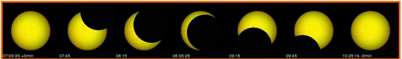
WHAT YOU WILL SEE OF THE ECLIPSE IN MOYALĒ – 76.3%