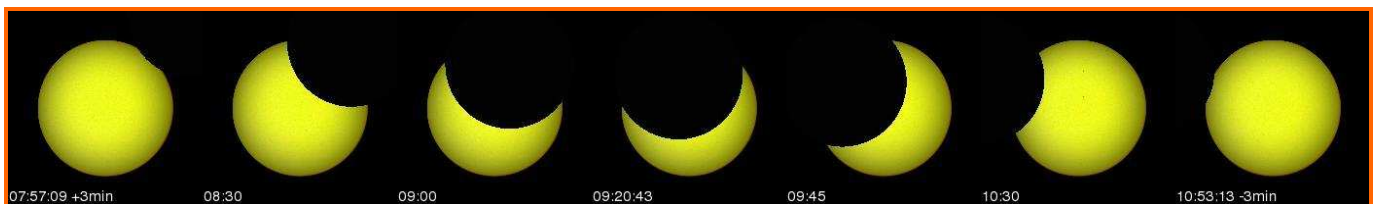
WHAT YOU WILL SEE OF THE ECLIPSE IN TIRANA –62.7%

➤ This document is the property of SODAP-SOBOMEX and protected by the international authors laws and the protection of the intellectual property.