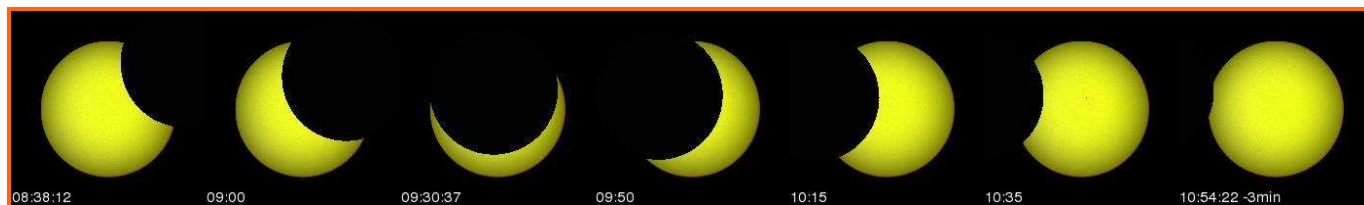
WHAT YOU WILL SEE OF THE ECLIPSE IN COPENHAGEN – 76.2%

➤ This document is the property of SODAP-SOBOMEX and protected by the international authors laws and the protection of the intellectual property.