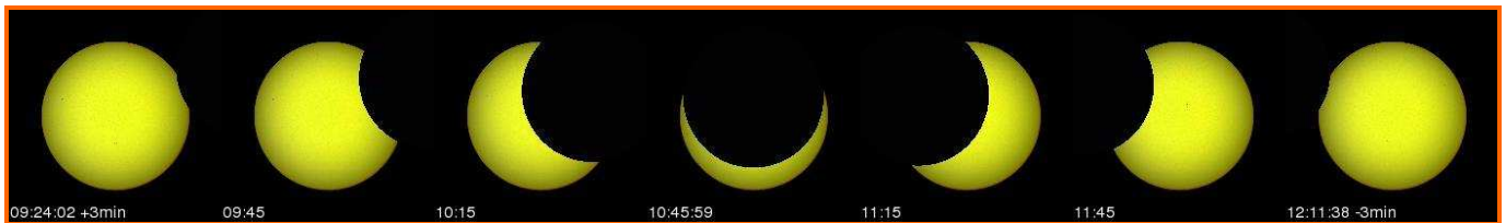
WHAT YOU WILL SEE OF THE ECLIPSE IN RIGA – 78.2%

> This document is the property of SODAP-SOBOMEX and protected by the international authors laws and the protection of the intellectual property.