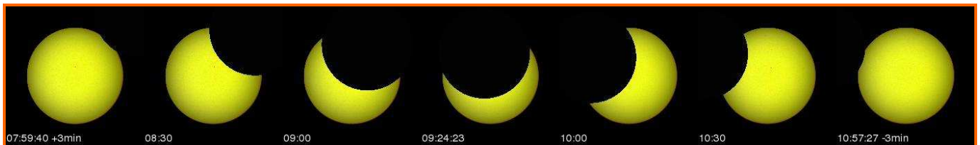
WHAT YOU WILL SEE OF THE ECLIPSE IN SKOPJE – 64.0%

➤ This document is the property of SODAP-SOBOMEX and protected by the international authors laws and the protection of the intellectual property.