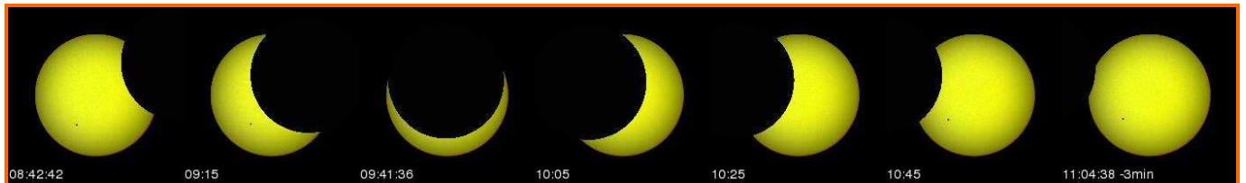
WHAT YOU WILL SEE OF THE ECLIPSE IN STOCKHOLM – 78.9%

➤ This document is the property of SODAP-SOBOMEX and protected by the international authors laws and the protection of the intellectual property.